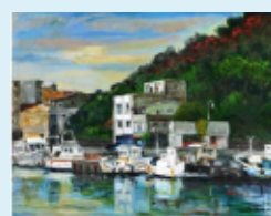
Love River, Kaohsiung